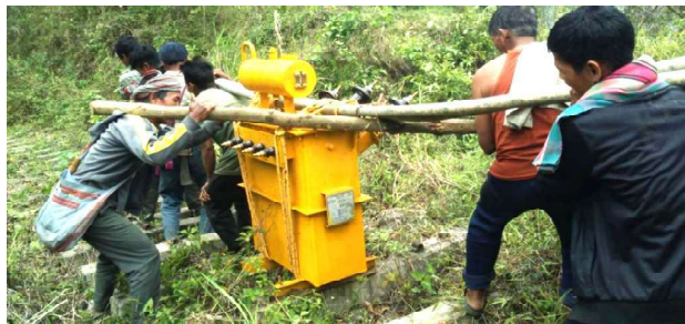
The photo PM Modi tweeted after announcement of Leishang Village as the last electrified village in India.

The Manipur State Power Distribution Company Limited (MSPDCL) claimed that before the launching of the Saubhagya scheme a total of 1,02,758 unelectrified households were there. After the launching of the Saubhagya scheme, all these unelectrified households are electrified between October 10, 2017 to March 31, 2019, and no house was left out as claimed by the implementing authority